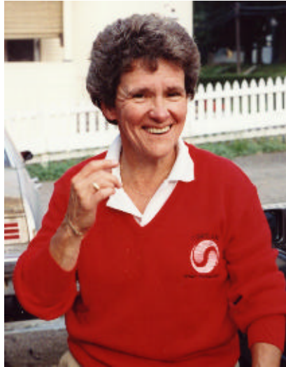
Suzanne Wingate Memorial Scholarship