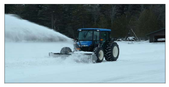
Bob DeShaw Plowing Ice Road

Raquette Lake froze over about Nov. 20, but not enough to walk on it. We then had to hike in and out the back way. By early December, we were walking on the ice and then snowmobiling. Unfortunately, Mother Nature did not help us during the critical period for making ice. It seems every time prior to zero or subzero temperatures, the ice became covered with a blanket of snow. Snow is a tremendous insulator. Just an inch or two prevents the cold from penetrating the ice. We spend many hours/ days plowing and maintaining the ice road. By early January, we were driving on about 14 inches of ice. Off the ice road, we could only register 10 inches of ice. As of March 18, I was still able to drive across the lake to get the mail.