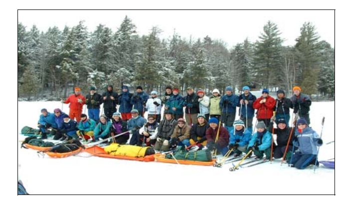
Students and staff from the College of William and Mary

Raquette Lake News is published biannually (fall/spring semesters) by the Center for Environmental and Outdoor Education at SUNY Cortland.