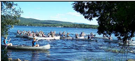
Start of canoe race

It doesn't matter if you finished first or last in this epic adventure, you were a participant.