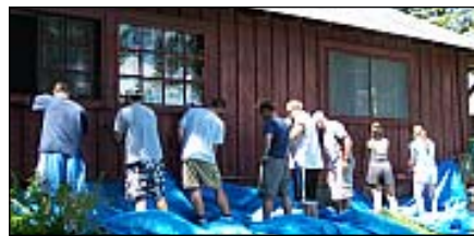
Physical Education students

With such a variety of offerings, many of the students elect to come to Raquette Lake more than once during their program with Empire State College. Since the Environmental Residencies inception in 1996, a total of 334 students have enrolled in this course. Success brings success. Forty-four students attended in 2006, making it the largest class in the program's history.