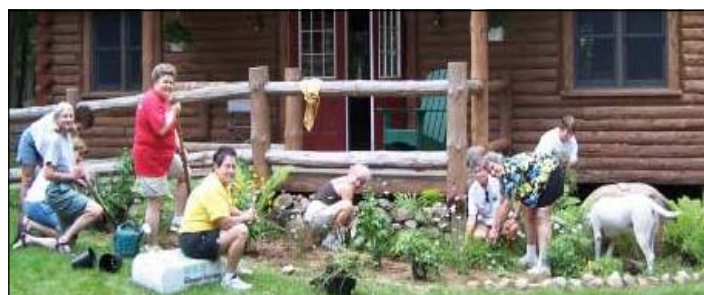
Arethusa sisters replanting Carlson Classroom garden

Hundreds, if not thousands, of hours have been donated by volunteers over the years to help maintain both Antlers and Camp Huntington. The projects include: cleaning, painting and scraping, planting, putting away equipment, raking, splitting firewood, taking down the ropes course, washing windows and working on trails. Volunteer efforts are greatly appreciated. Without this help, the outdoor facilities at Raquette Lake would not look as nice as they do.