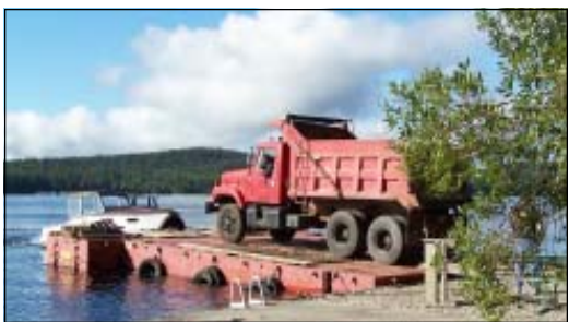
Barge delivering stone

As most of you know, everything that comes to Camp Huntington is transported by barge or comes across the ice road during the winter months. Consequently, it is very costly to have certain items transported to Long Point. One costly item is a truck load of stone. During each of my group orientations, I stress this point. The stone issue on the main dock is a "guy thing." They love to throw the stones into the water. The students like to see how far the stones can go or how many times the stone will skip?