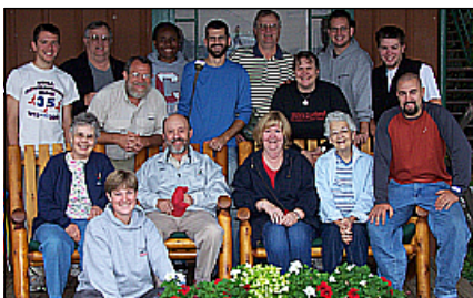
2006 Annual Metcalf Retreat