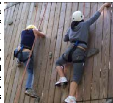
Students on climbing wall